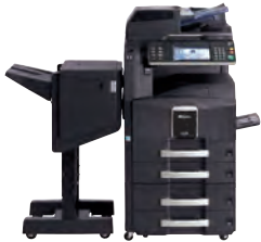
Shown with Optional DSDP, 500 x 2 Tray, and 1,000 Sheet Finisher 48.6" W x 25.5" D x 48.9" H