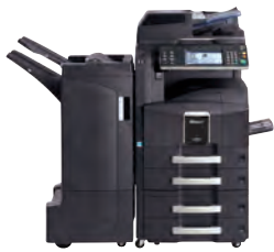
Shown with Optional DSDP, 500 x 2 Tray, and 3,000 Sheet Finisher 50.7" W x 25.5" D x 48.9" H